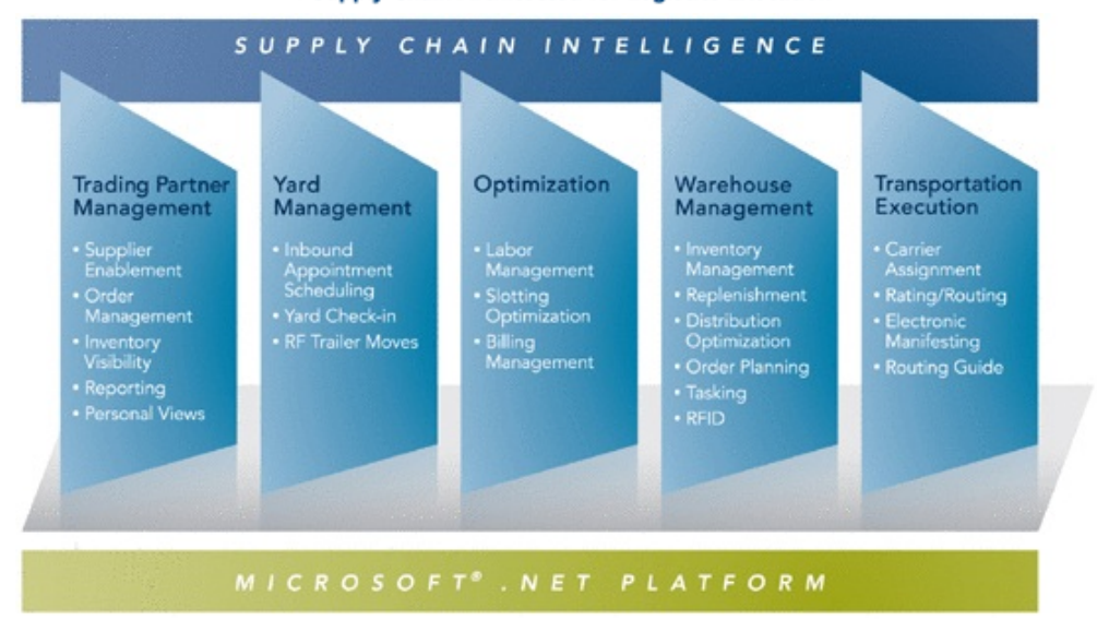
Figure 4: Manhattan's Supply Chain Architected for Logistics Execution is a portfolio of logistics solutions that leverages the Microsoft ®.NET platform and is designed for organizations that want to improve their logistics operations quickly with limited technical resources. SCALE also is a popular solution choice for organizations operating in countries with emerging supply chain ecosystems.

Supply Chain Architected for Logistics Execution