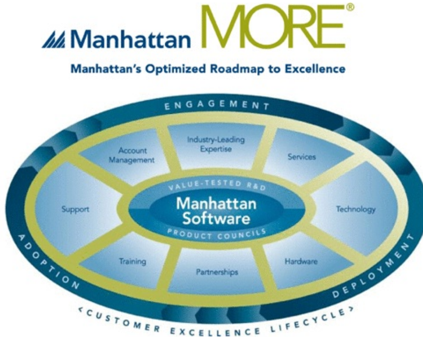
Figure 1: Manhattan MORE ® depicts Manhattan’s Optimized Roadmap to Excellence, our comprehensive methodology for delivering customer value through supply-chain-centered people, principles, products, protocols, and processes. We build long-term customer relationships through our Customer Excellence Lifecycle, which leverages our software, expertise and enriched services in a high-touch cycle of engagement, deployment, and adoption for continuous supply chain advancement.

We deliver these benefits in a distinctive way through a set of supply-chain-centered capabilities we call Manhattan MORE ® : Manhattan’s Optimized Roadmap to Excellence (See Figure 1). These elements work together to coordinate insights, people, workflows, assets, events, and tasks across supply chain functions from planning through execution. They also help to coordinate actions, data exchange, and communication among participants in supply chain ecosystems.