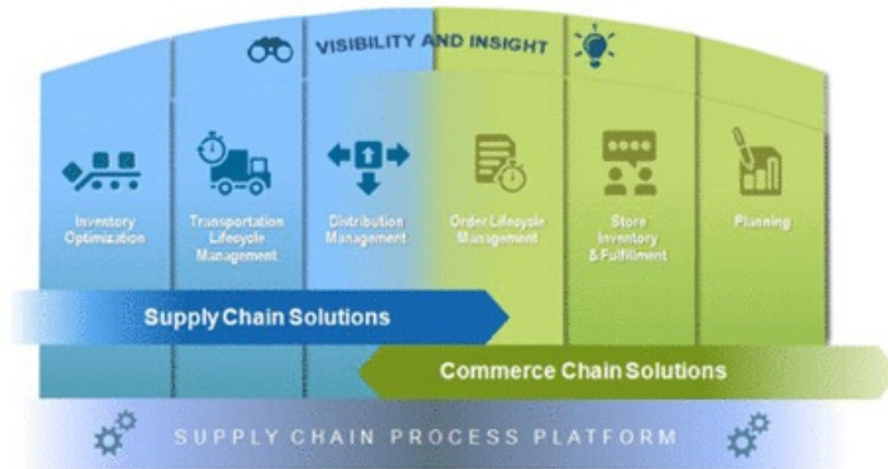
Figure 2: Manhattan SCOPE® Supply Chain Optimization, Planning through Execution, is a portfolio of supply chain solution suites that leverages our Supply Chain Process Platform to enable high degrees of operational insight, performance, agility, and optimization at a tightly-managed and overall lower total cost of ownership. This platform-based architecture also enables combining different elements of different solution suites into X-Suite solutions to address specific supply chain challenges.

SCOPE is positioned for companies that consider supply chain software, processes, and technology strategic to their market leadership. It is the leading portfolio of supply chain commerce solutions built on a common technology platform. SCOPE is distinctive for several reasons. First, it clearly defines the role and capabilities for supply chain and commerce chain solutions. Second, it articulates the convergence of supply chain and commerce chain, particularly in the areas of Distribution Management and Order Lifecycle Management. Finally, it highlights the central value of a supply chain platform by elevating visibility and insight above all of the functional capabilities.