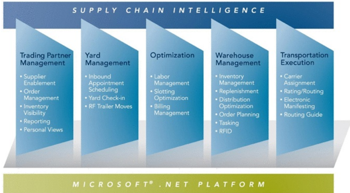
Figure 4: Manhattan's Supply Chain Architected for Logistics Execution is a portfolio of logistics solutions that leverages the Microsoft® .NET platform and is designed for organizations that want to improve their logistics operations quickly with limited technical resources. SCALE also is a popular solution choice for organizations operating in countries with emerging supply chain ecosystems.