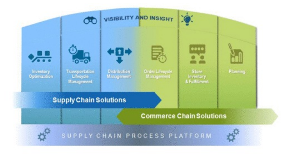
Figure 2: Manhattan SCOPE® Supply Chain Optimization, Planning through Execution leverages the investments we've made in our Supply Chain Process Platform™to deliver both the traditional bottom-line benefits associated with supply chain improvements and the top-line revenue gains created by commerce initiatives. SCOPE provides Supply Chain Solutions to optimize efficiency and performance coupled with Commerce Chain Solutions to seize opportunities for revenue growth. Our fully integrated Visibility and Insight applications provide actionable insight into your overall performance.