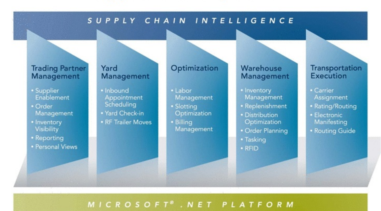
Figure 4: Manhattan's Supply Chain Architected for Logistics Execution is a portfolio of logistics solutions that leverages the Microsoft's<sup>®</sup>.NET platform and is designed for organizations that want to improve their logistics operations quickly with limited technical resources. SCALE also is a popular solution choice for organizations operating in countries with emerging supply chain ecosystems.