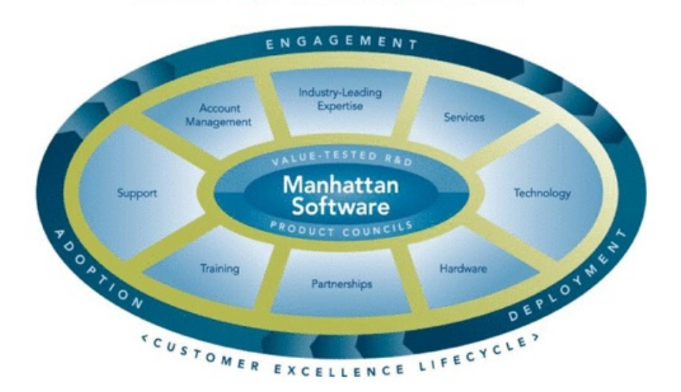
Figure 1: Manhattan MORE® depicts Manhattan's Optimized Roadmap to Excellence, our comprehensive methodology for delivering customer value through supply-chain-centered people, principles, products, protocols, and processes. We build long-term customer relationships through our Customer Excellence Lifecycle, which leverages our software, expertise and enriched services in a high-touch cycle of engagement, deployment, and adoption for continuous supply chain advancement.