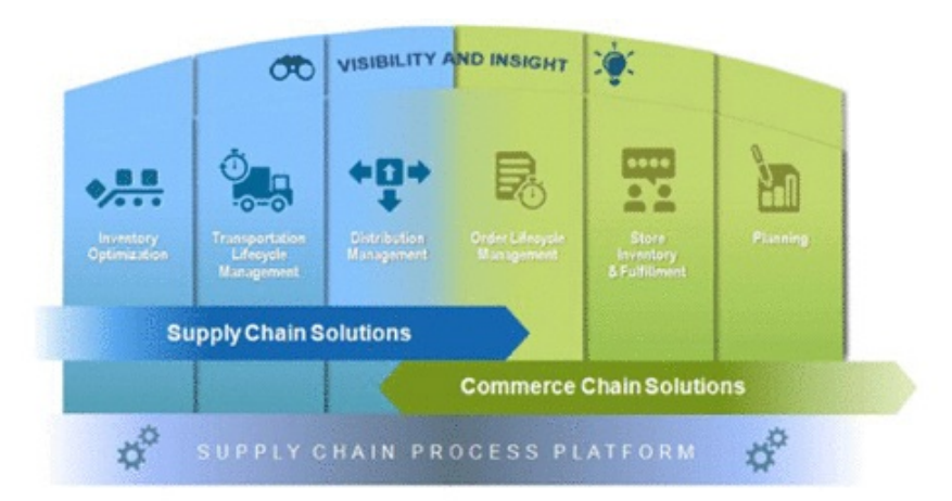
Figure 2: Manhattan SCOPE® Supply Chain Optimization, Planning through Execution, is a portfolio of supply chain solution suites that leverages our Supply Chain Process Platform to enable high degrees of operational insight, performance, agility, and optimization at a tightly-managed and overall lower total cost of ownership. This platform-based architecture also enables combining different elements of different solution suites into X-Suite solutions to address specific supply chain challenges.

SCOPE is positioned for companies that consider supply chain software, processes, and technology strategic to their market leadership. It is the leading portfolio of supply chain commerce solutions built on a common technology platform. SCOPE is distinctive for several reasons. First, it clearly defines the role and capabilities for supply chain and commerce chain solutions. Second, it articulates the convergence of supply chain and commerce chain, particularly in the areas of Distribution Management and Order Lifecycle Management. Finally, it highlights the central value of a supply chain platform by elevating visibility and insight above all of the functional capabilities.